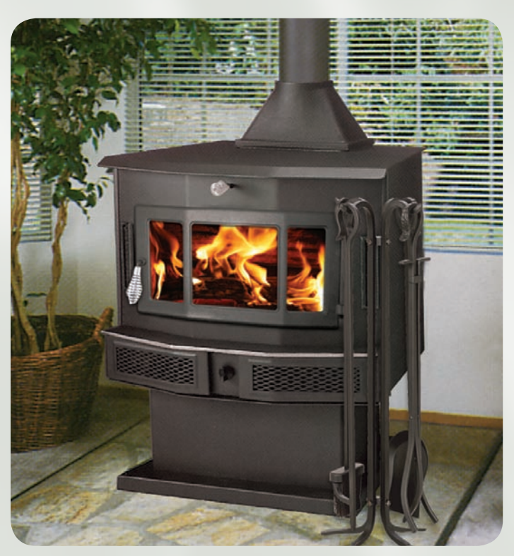
Bay 2012C Freestanding Wood Stove

Whatever your style, you can be confident that the ENERGY KING Bay series wood stove or fireplace insert will provide exceptional performance and value.