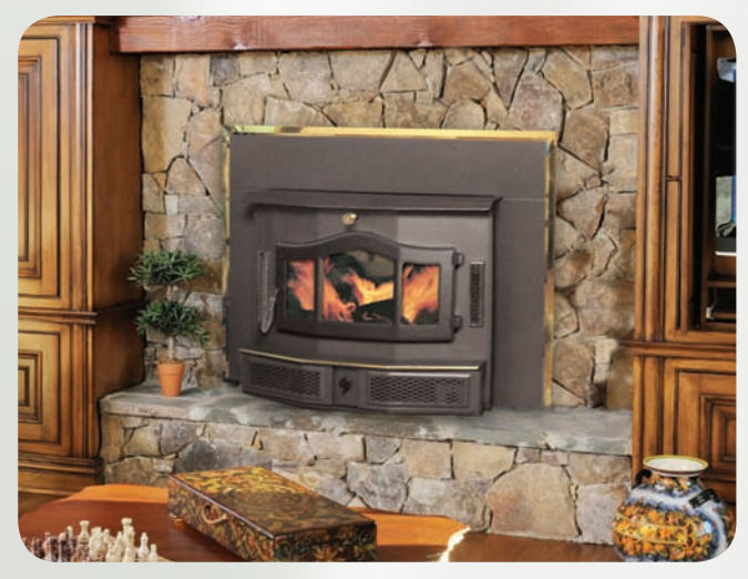
Bay 2000C Fireplace Insert