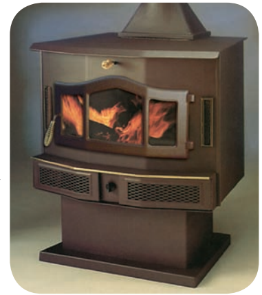
Bay 2000C Freestanding Wood Stove

Once the installation is complete, operation is a simple matter of building a fire and setting the burn rate using the touchsensitive draft control. Then you can sit back and enjoy the splendor of the flames!